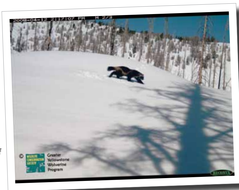
One in a series of photographs that provide an interesting look at behavior associated with a wolverine den. This wolverine is the presumed father of the cub in the nearby den.

as much as 500 square miles per male—in search of meat that they then systematically cache in 'iceboxes'. The study sheds light on how wolverines are adapted to resource-poor environments, even nursing and raising young successfully in below-freezing conditions. By using refrigeration to plan ahead for this challenging season, wolverines reduce competition with other carnivores.