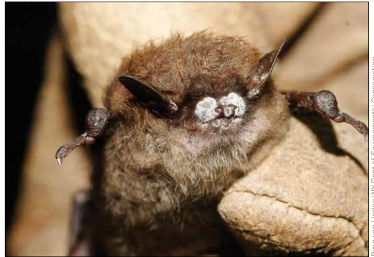
Bat infected with white-nose syndrome.

White Nose Syndrome is a distinctive fungal disease, characterized by an unusual white substance—the fungus—found on the muzzles of bats, which has killed more than five million bats across Eastern North America. In Canada the disease is now associated with the death of over one million bats and with the rapid declines of several bat species—including little brown bat and tri-colored bat.