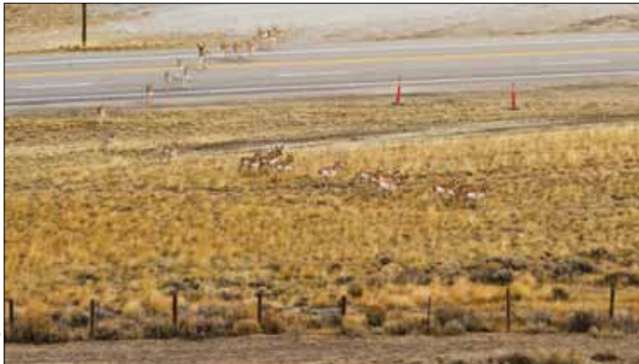
Pronghorn cross U.S. 191 during their annual migration.

The Wyoming Department of Transportation, armed with data from WCS, is stepping up and investing $9.7 million to reduce vehicle-wildlife collisions here by installing highway-crossing structures—eight overpasses and underpasses are under construction. This past fall, a team of WCS biologists monitored the behavior of pronghorn heading south to their winter range. The team will work directly with construction designers to help them understand where and why animals might get stalled and what structural attributes facilitate successful crossing of the highway. Since crossing structures are a relatively new tool for conservation, it is crucial to align future design and placement with the actual needs of wildlife.