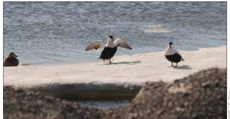
Common eiders are 'highly vulnerable' because they rely on barrier islands that will erode with sea level rise.

In the Arctic, climate change is occurring at nearly twice the global average rate. Arctic Alaska is the destination for up to 90 bird species, most notably shorebirds and waterfowl that flock there in the millions to breed during the brief summer. Many of these birds rely on wetland and lake systems created in part by permanently frozen ground (permafrost). Warming temperatures have already begun to affect the depth of the permafrost, timing of the transition from winter to spring, and coastline erosion from storms. The populations of several species, like the spectacled eider and the buff-breasted sandpiper, are already declining, yet wildlife managers are just beginning to understand how climate change might impact bird species in Arctic Alaska. In 2011, WCS assessed the 'climate change vulnerability' of Alaskan breeding birds to create a ranking to target conservation and management action, an important first step to protect species that are most sensitive to climate change.